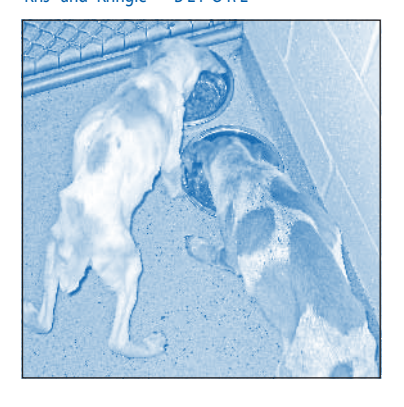
Kris and Kringle - BEFORE