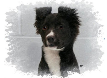
Angel after surgery