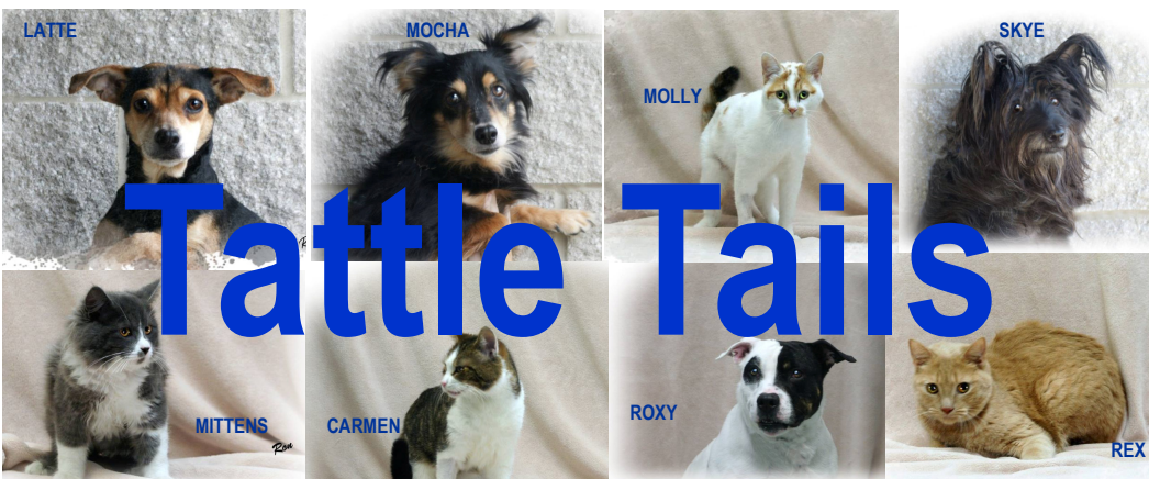
Caring for animals in Need Since 1955