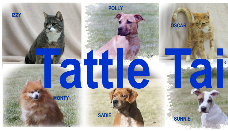
Caring for animals in Need Since 1955