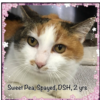
Sweet Pea, Spayed, DSH, 2 yrs